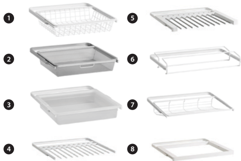
Shelves (all depths) Max recommended load - evenly placed